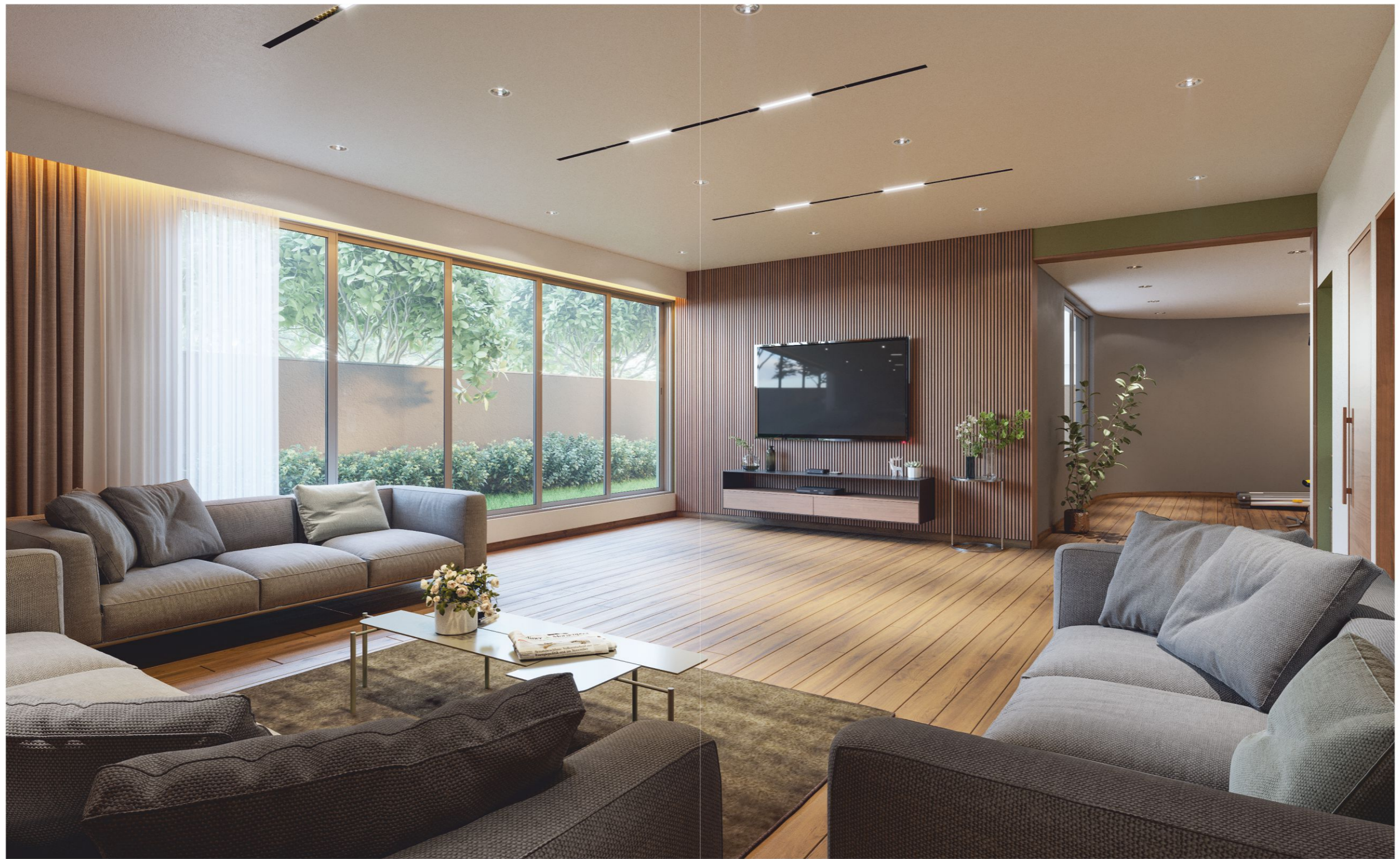
MULTI FUNCTIONAL HALL